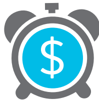
OnWatch - 21% less